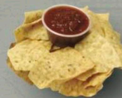
CHIPS & SALSA