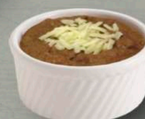
BEANS & CHEESE