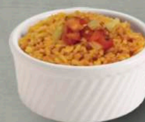
SPANISH PICO RICE