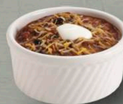
BLACK BEAN CHICKEN CHILI